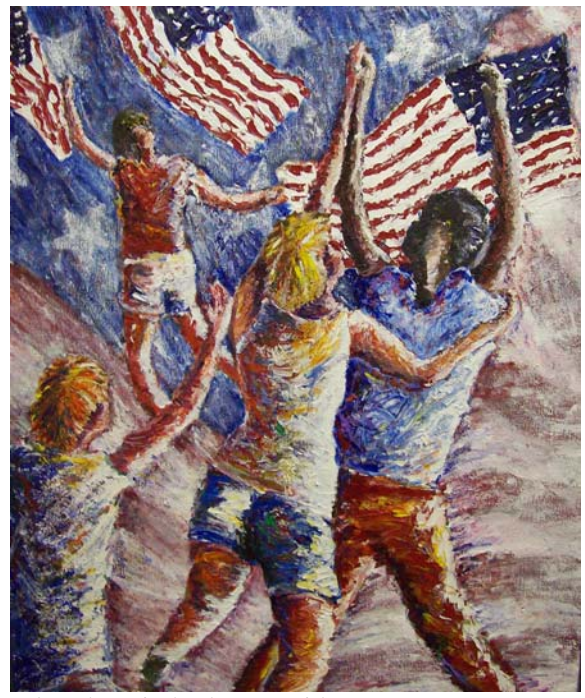
Flags by Kimberly Burnside